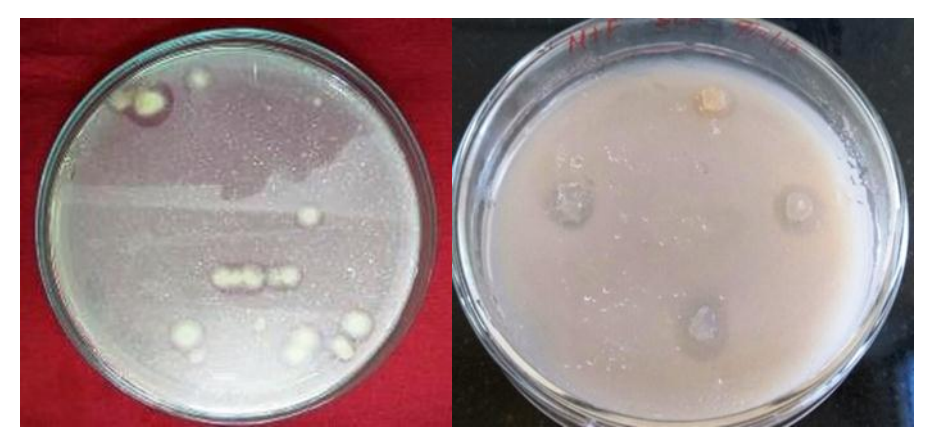
Plate. 1: Solubilization of Zinc oxide by KSB isolates SBF and SDM

Significantly highest amount of release of zinc was observed in SBF followed by SAF and SDM; whereas very least was found in SAM and SCM. The results are in par with previous work (Vasanthi et al., 2012), studied the capability of in vitro solubilization of zinc from insoluble zinc oxide by Bacillus sp, Similar work (Senthil Kumar, 1997), showed the ability of zinc solubilization by Bacillus and Pseudomonas from insoluble zinc oxide, zinc phosphate (Spheralite) and zinc carbonate in both plate and broth assay.